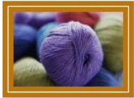
Needlecrafts & Textiles