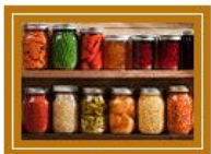
Home & Garden